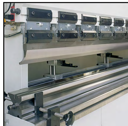
Tool top / bottom