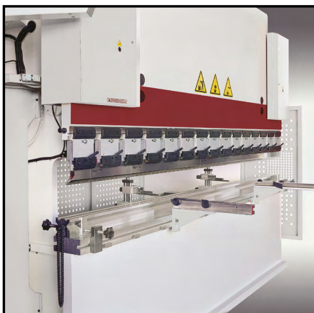
Front support arms