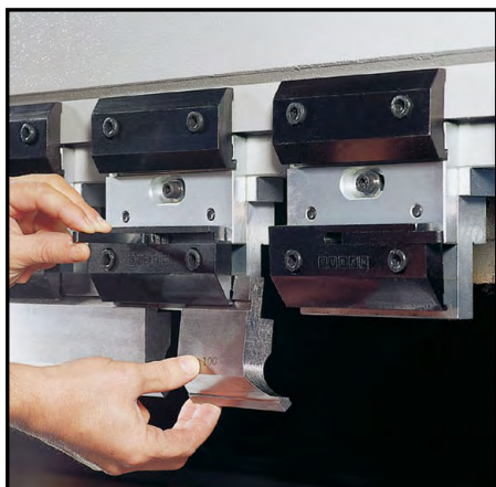
Quick release clamps