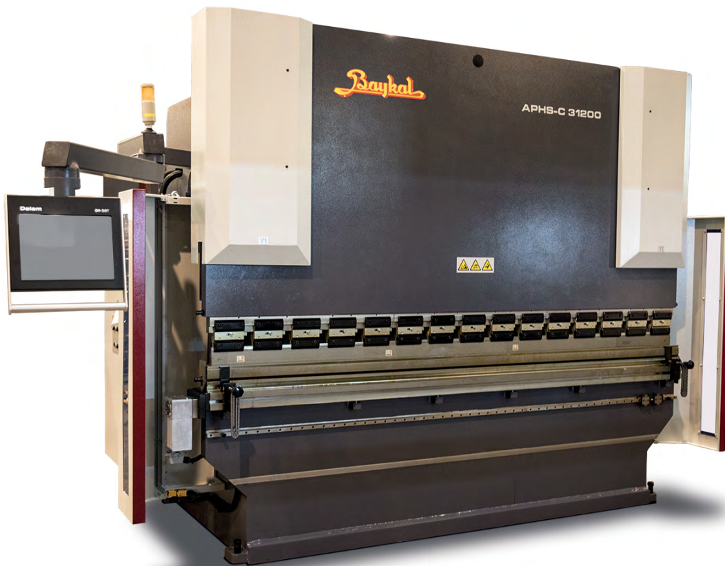
APHS PRO 3110x200

Easy-to-use CNC system with complete bending computations and large tool library ideal for multi-bending of complex forms, as well as for volume production which require constant repeatability. Bend accuracy and repeatability at least five-fold higher than a conventional press brake. Fully synchronised Y1-Y2 axes to \pm 0.01\text{mm} via proportional valves and precision linear scales. Very fast AC servo backgauge system controlled by CNC. Euro-style top clamps with intermediaries and (available) quick-release clamping. Top tool is sectionalised gooseneck punch and bottom tool is sectionalised 4-V die. High stroke and daylight values. Extra deep (410 / 500 mm) throat gap. Two front arms on linear rail and dual footswitch console with emergency stop. Swiveling pendant arm and side / rear safety gates (electrically interlocked and/or light or laser guarded). Compactly-wired PLC electrics in ventilated cabinet. Type APHS Compact are constructed with rigidly welded, monoblock machine frame for minimum deflection under load. Ram travel fully supported in low friction slideways. Options for tooling and crowning.