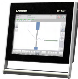
Delem DA 58T