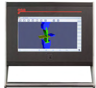
ESA S640 Touch