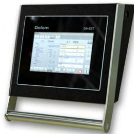
Delem DA 53