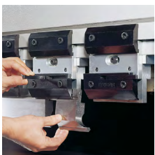
Quick release Clamping

Easy-to-use CNC system with complete bending computations and large tool library ideal for multi-bending of complex forms, as well as for volume production which require constant repeatability. Bend accuracy and repeatability at least five-fold higher than a conventional press brake. Fully synchronised Y1-Y2 axes to \pm 0.01\text{mm} via proportional valves and precision linear scales. Very fast AC servo backgauge system controlled by CNC. Euro-style top clamps with intermediaries and (available) quick-release clamping. Top tool is sectionalised gooseneck punch and bottom tool is sectionalised 4-V die. High stroke and daylight values. Extra deep (410 / 500 mm) throat gap. Two front arms on linear rail and dual footswitch console with emergency stop. Swiveling pendant arm and side / rear safety gates (electrically interlocked and/or light or laser guarded). Compactly-wired PLC electrics in ventilated cabinet. Type APHS Compact are constructed with rigidly welded, monoblock machine frame for minimum deflection under load. Ram travel fully supported in low friction slideways. Options for tooling and crowning.