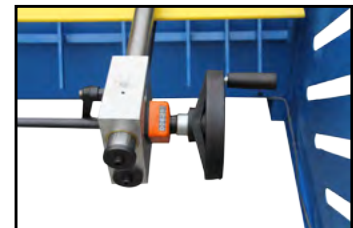
Man. backgauge w/counter