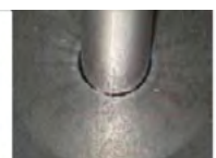
Without True Hole