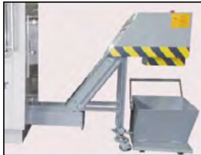
Chip conveyor can easily be retrofitted