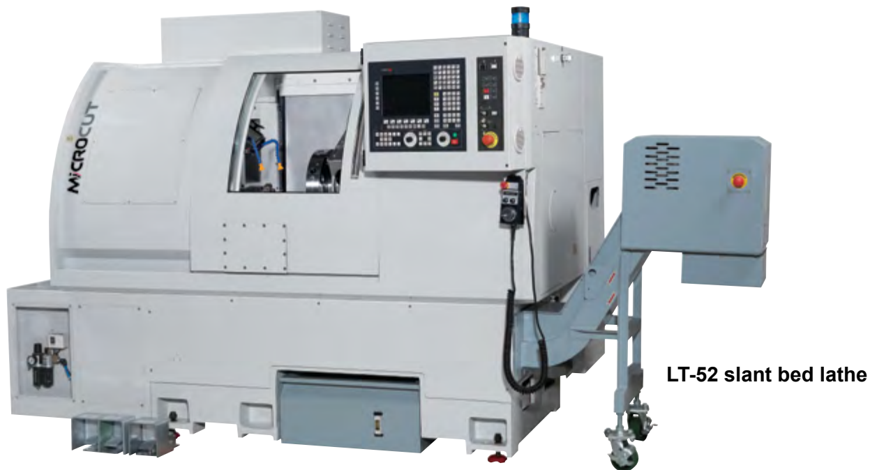
LT-52 slant bed lathe

MICROCUT CNC slant bed lathe type LT offers an exceptional combination of standard features in a rugged, affordable package. This machine has greater speed, power, accuracy and durability. The LT-series features an 11 kW spindle drive (Fanuc) and includes a high quality 3-jaw power chuck as standard equipment.