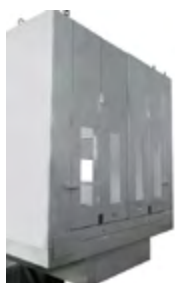
Table guard with folding door