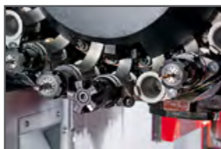
20-station CM 260