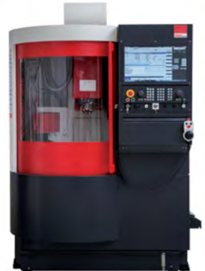
CONCEPT MILL 260

CONCEPT MILL CNC milling machines are flexible machines ideal for small businesses or CNC training. Thanks to its modular design it can be connected to a CIM network and equipped with training software and courseware. The milling machines has a wide range of automation options.