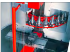
8-station CM 55