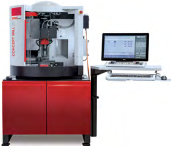
CONCEPT MILL 55