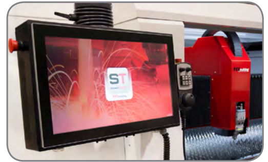
SmartTouch HMI V 6.0