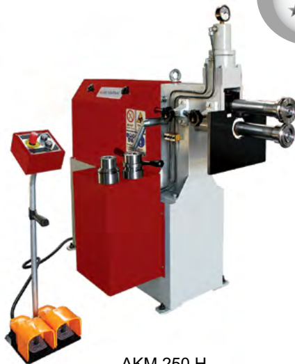
AKM 250 H