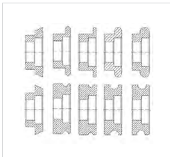
AK 125 standard rolls 5 sets of rolls