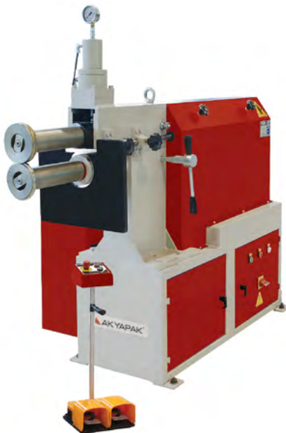
AKM 400 H