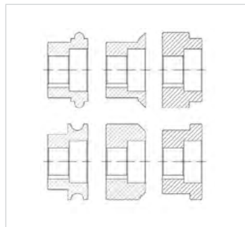
AKM 250 standard rolls 3 sets of rolls