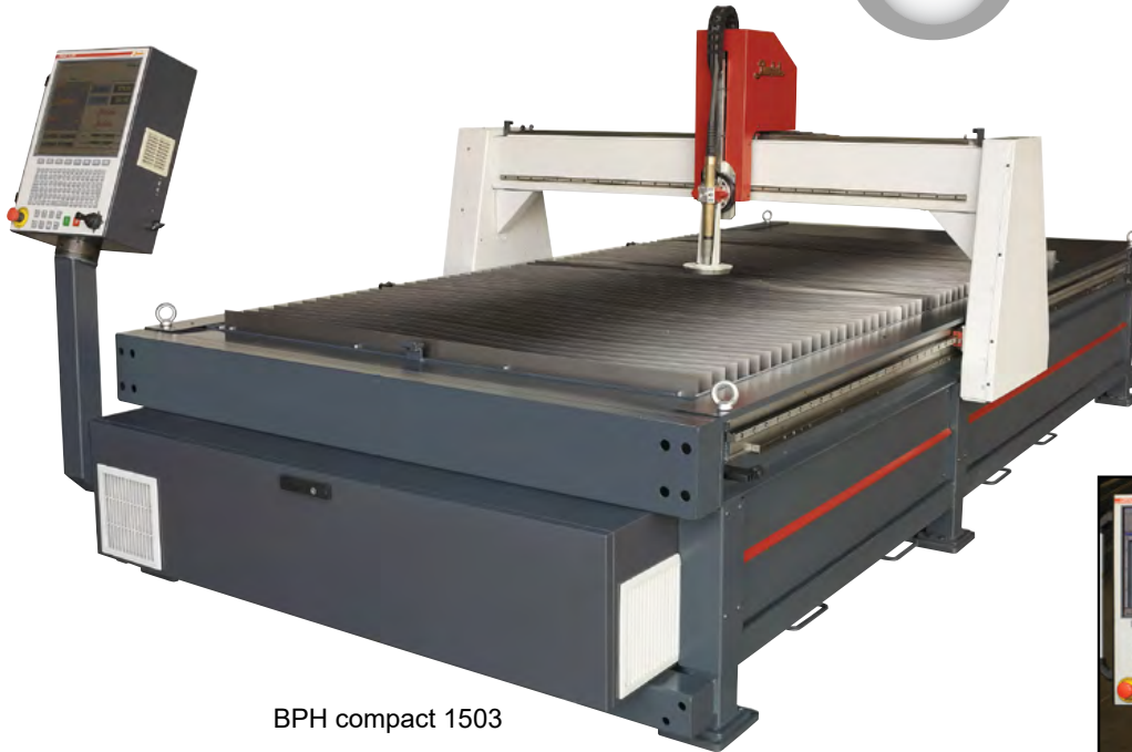
BPH compact 1503