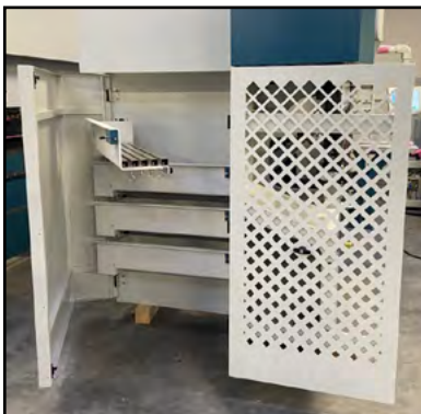
Built-in tool cabinet